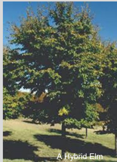
A Hybrid Elm