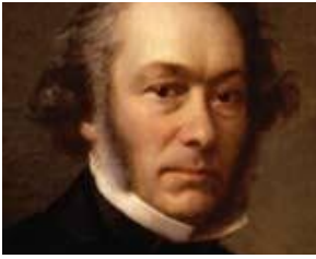
Richard Cobden 1804-1865