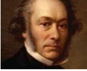
Richard Cobden 1804-1865